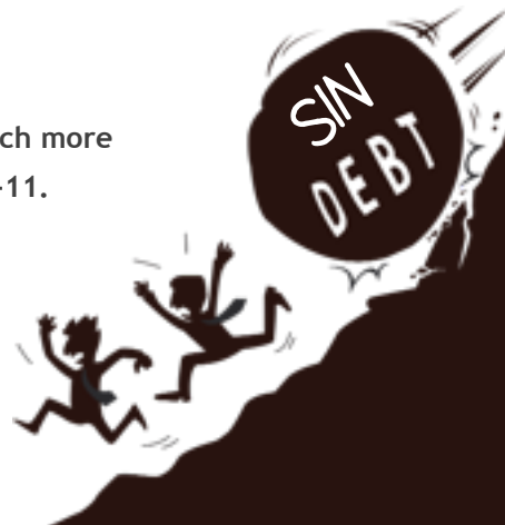
IN THE "NICK" OF TIME!