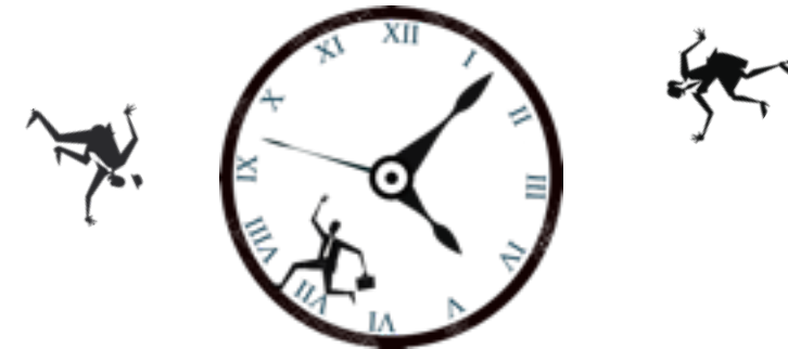
When we were still weak ...